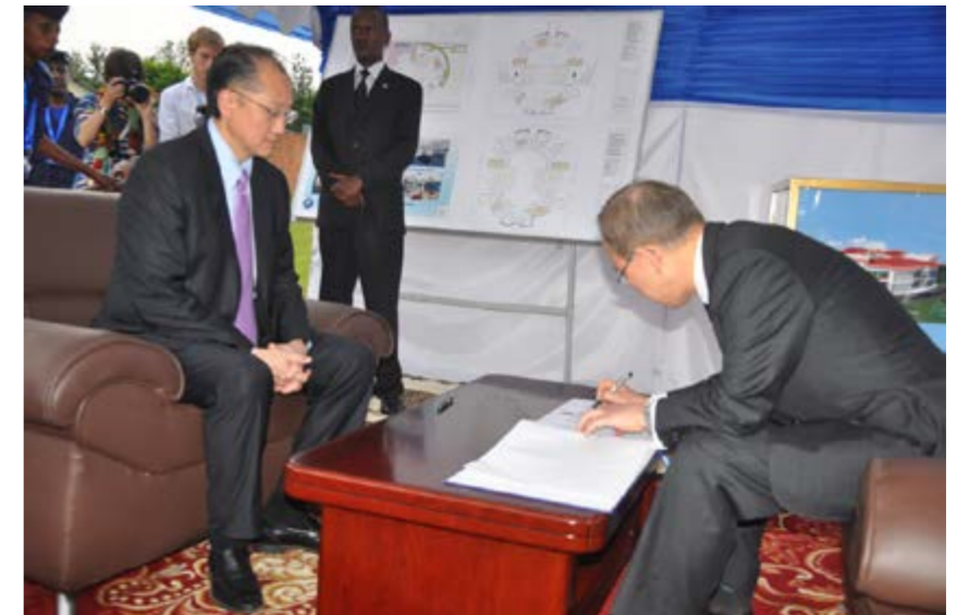
Ban Ki Moon yandika mu gitabo cy'abashyitsi