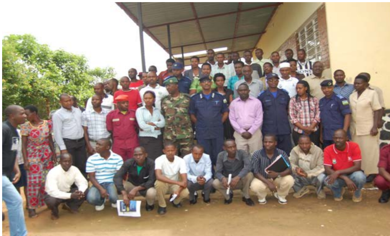
Uru rugamba rureba inzego zose

Yahamagariye Inzego zose, kutemera no kwamagana abakingira ikibaba abakora bene ibyo byaha byibasira inyokomuntu. "Kudahana nta kindi bibyara uretse ubugome n'ubwicanyi". Ahereye ku rugero rufatika