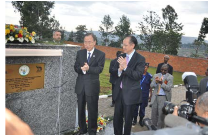
Ban Ki Moon amaze gushyira ibuye ry'ifatizo ahazubakwa ikigo nyafurika gishinzwe kurwanya ihohoterwa rikorerwa abakobwa n'abagore