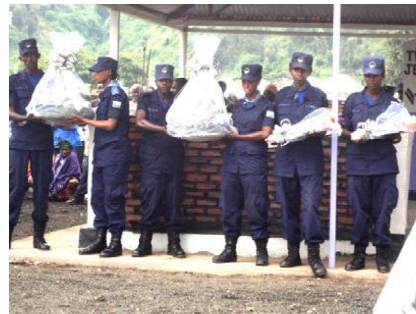
Abapolisi baje kunamira abazize jenocide i Nyanza ya Kicukiro

ziriho ubu cyane cyane Polisi y'u Rwanda ziharaniye umutekano w'abanyarwanda mu bumwe n'ubwiyunge kandi ko zitazateshuka kuri icyo ntego, zigafatany