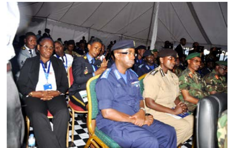
Abayobozi mu nzego z'umutekano mu Rwanda, bashyigikiye irandurwa ry'ihohoterwa rishingiye ku gitsina