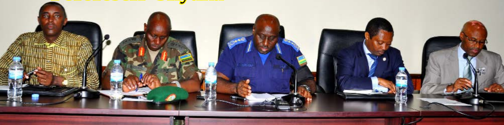
Abayobozi batandandukanye bari bitabiriye ikiganiro