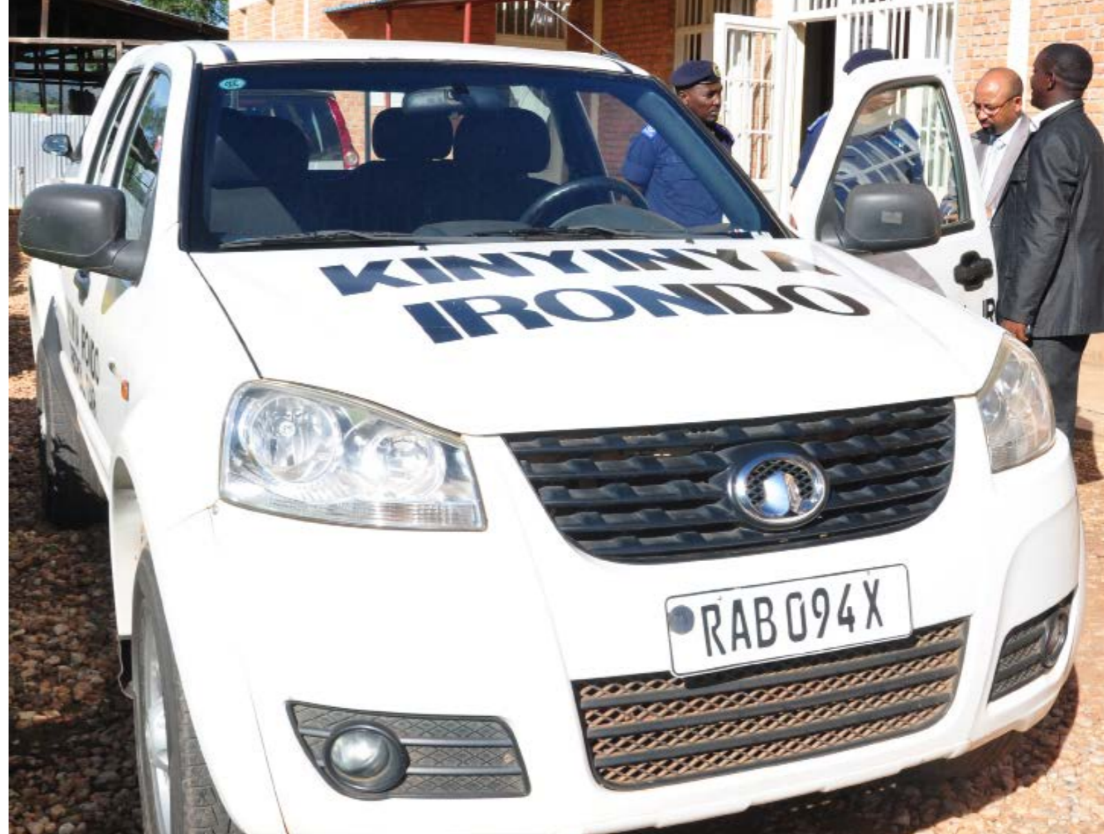
Iyi modoka yaguzwe n'abaturage bumvise akamaro ko kwirindira umutekano mu Murenge wa Kinyinya mu Karere ka Gasabo

kubikangurira abanyeshuri, abaturage, abavugaga rikijyana, (opinion leaders) ku ruhare rwabo mu gucunga umutekano muke.