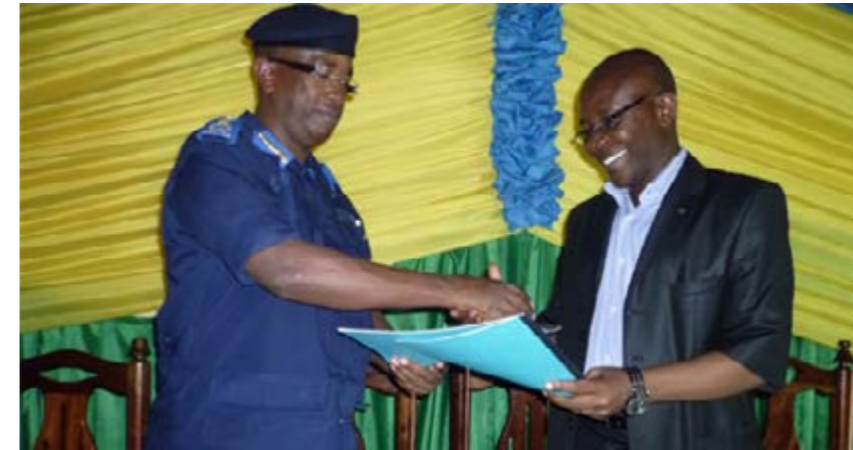
Umuyobozi wungirije wa Polisi ahererekanya amasezerano n'umuyobozi w'akarere ka Rubavu.

Polisi y'u Rwanda ivuye ku amasezerano agamije gukumira ibyaha yasinanye n'akarere ka Rubavu tariki 14/5/2013 amezwe nk'imihigo inzego zombi zigomba kuzajya zigenderaho zuzuzwa inshingano zazo mu kurinda umutekano.