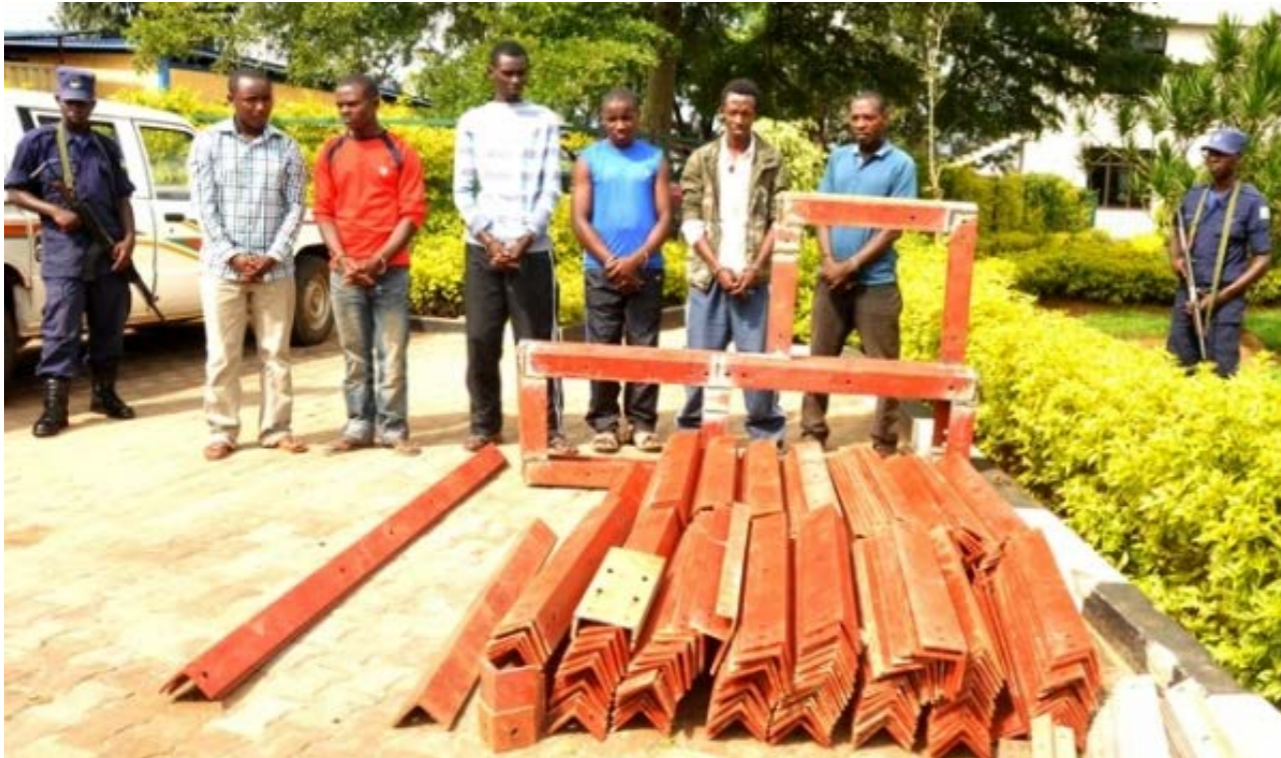
Ngabo bamwe mu bakekwaho kwiba ibyuma bitwara insinga z'amashanyarazi

A batuye umujyi wa Kigali hamwe no mu nkengero zawo, bakomeje kwinubira ibura ry'amashanyarazi, ndetse yanagaruka akaza atwika ibikoresho byari bicometse nk'ama televiziyo, Firigo etc.. Ewasa yakomeje gusobanura ko impamvu z'ibura ry'amashanyarazi mu bice byinshi bigize umujyi wa Kigali, ari ukugira ngo babashe gusaranganya ahari kubera ikibazo cy'ubujura bw'ibiti n'insinga z'amasharazi, bituma abenshi bibaza ukuri kwabyo. EWASA ifatanyije n'abaturage bakomeje gushaka amakuru y'ababa biba ibyo byuma n'insinga n'ababa babyihishe inyuma nibwo tariki ya 22