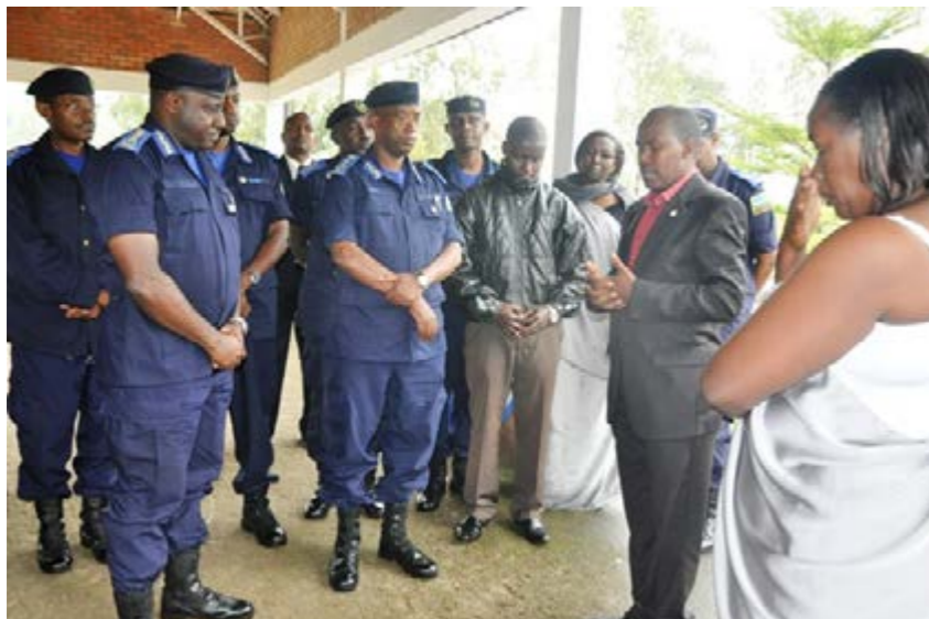
Mayor wa Kamonyi ari kumwe n'abayobozi bakuru ba Polisi y'u Rwanda

Mu gihe Abanyarwanda twese tukiri mu minsi 100 yo kwibuka jenocide yakorewe abatutsi mu w'1994, Polisi y'u Rwanda nayo yifatanyije n'abandi banyarwanda, maze umunsi wo kuwa gatatu tariki ya 17 iwuharira igikorwa cyo gusura inzibutso za jenocide zitandukanye.