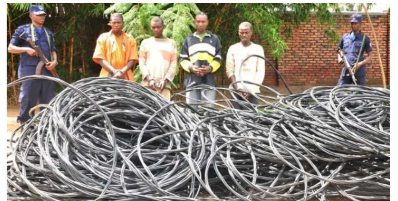
Aba nabo ni abakekwaho kwiba insinga za EWASA

Amajyambere hamwe n'iterambere ntibyagerwaho niba ubufatanye mu gukumira ikibi cyane ubujura bw'ibikoresho bigirira akamaro abantu benshi, bakaba bibazaga ko mu Rwanda bitewe n'ukuntu ibikorwa remezo byangiritse mu gihe cya Jenoside bikagorana kongera kubona ibindi, twari tugeze mu gihe cyiza cyo kumenya akamaro k'ibikorwa remezo bifitiye akamaro abantu benshi, kuko ibura ry'amashanyarazi rigira ingaruka ku bantu benshi hamwe n'igihombo ku nganda zikora ibintu bitandukanye tutaretse n'igihombo igihugu kibikuraho, musomyi rero gira uruhare uburizamo icyaha cy'ubujura.