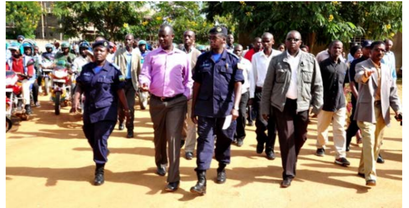
Inzego z'ubuyobozi ku rwego rw'akarere, abaturage na Polisi bakoze urugendo rugamije kwamagana ihohoterwa rishyingiye kugitsina, no kwamagana ifatwa kungufu ry'abagore n'abana.

mu guteza imbere umwari n'umutegarugori nk'uko biri u Rwanda rwabigize umwihariko, CIP Shafiga yerekanye ko icy'ingenzi ari uko ikirutaho ari ugukemura impamvu bikomokaho kuko usanga binatanye isano n'ihohoterwa rishingiye ku gitsina.